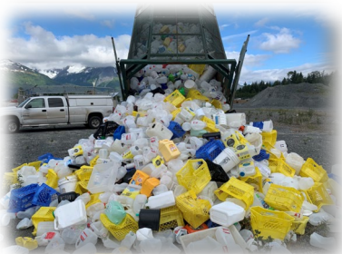
Post Consumer Resin