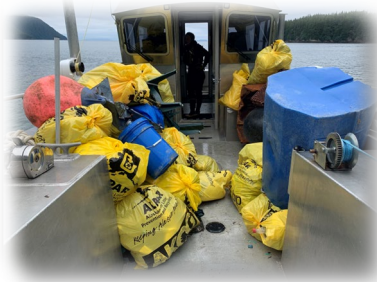
Plastic Ocean Waste