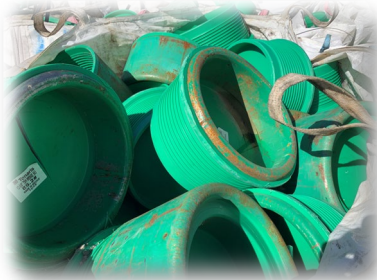
Post Industrial Resin