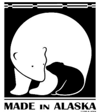
4x4 (3.375 x 3.375)