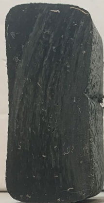
2x4 (1.5 x 3.5)