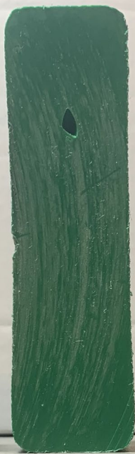
2x6 (1.5 x 5.25)